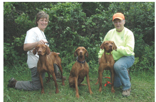
Savvy, Dart & Wylie

But his feeding limitations have not set him back. He's the most birdie dog I've ever had. Not only have we been hunting, but he's earned a Prize II in NAVHDA with his sister (see picture) and an AKC Junior Hunter title.